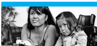
Wesley Disability Services