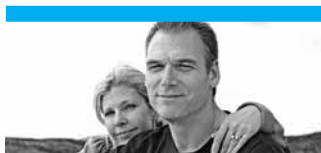
Wesley Mental Health Services