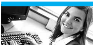
Wesley Employment, Training & Conferences