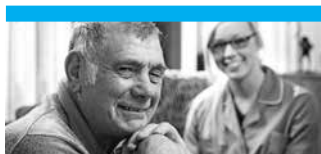
Wesley Help at Home Services