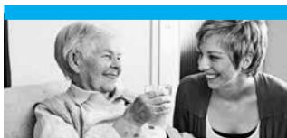
Wesley Carer Services