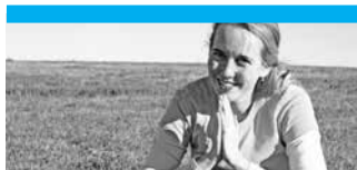
Wesley Congregational Life

For over 200 years our commitment to our Christian faith has guided us to create long-term holistic solutions that address the needs of the whole person, not just their current challenges.