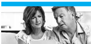
Wesley Counselling Services