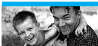
Wesley Foster Care Services